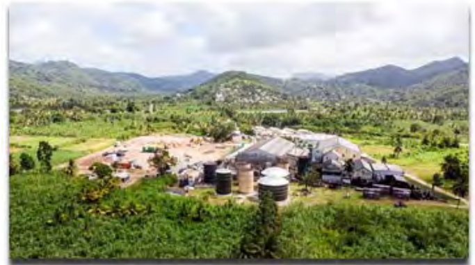
Saint Lucia Distillers

Explore this local distillery and learn about the island's centuries old rum-making tradition.